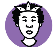
SUGAR PLUM FAIRY