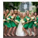
Top Ten Places To Meet The Irish Love Of Your Life