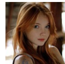
Top 10 Words Irish Women Say To Their Men