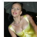
7 Celebs Who In Facts Have Twin Siblings

Pursuant to Title 17 U.S.C. 107, other copyrighted work is provided for educational purposes, research, critical comment, or debate without profit or payment. If you wish to use copyrighted material from this site for your own purposes beyond the 'fair use' exception, you must obtain permission from the copyright owner.