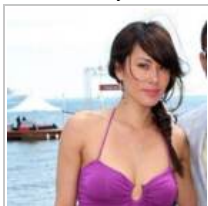
Why This Photo Would Be A Crime If Taken Today...