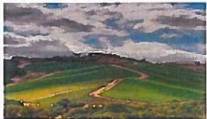
Central Coast, California