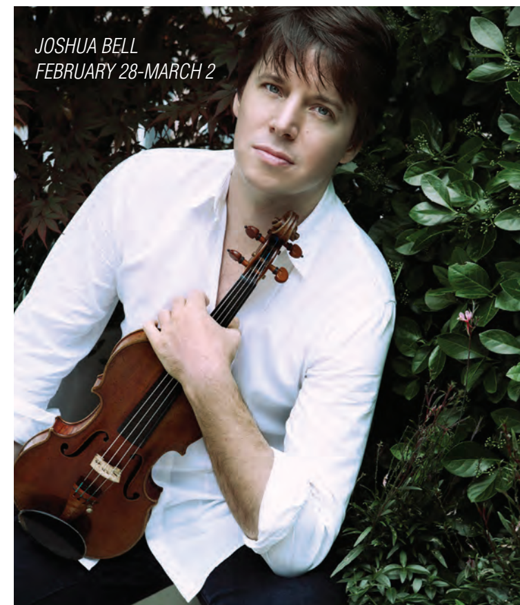
JOSHUA BELL FEBRUARY 28-MARCH 2

Maestro Honeck presents the world premiere of a work by five composers representing different Pittsburgh universities. This five-part work was inspired by ancient elements earth, water, air, fire, and metal. Then, NASA video footage of the cosmos accompanies a memorable performance of The Planets by Gustav Holst.