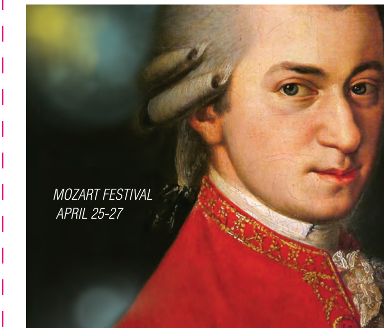
MOZART FESTIVAL APRIL 25-27