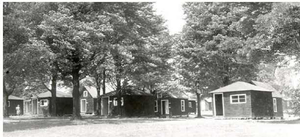
Practice shack where George Gershwin wrote his Piano Concerto, Chautauqua Institution, NY.

The Chautauqua Institution later dedicated the piano practice shack where he did most of his work to Gershwin on July 17, 1952, after which the Chautauqua Symphony Orchestra played the piano concerto to a full crowd at their open-air amphitheater.